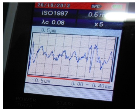
Fig 4:- Graph displaying the values.

Hardness Measurements : -Before & after the pH – cycling regime all specimens was analyzed using a Digital microhardness Tester in vickers hardness value