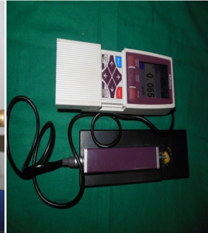
Fig 3:- Profilometer

Surface Roughness Measurements : - Before afterthe pH – cycling regime all specimens was analyzed using surface Roughness Tester