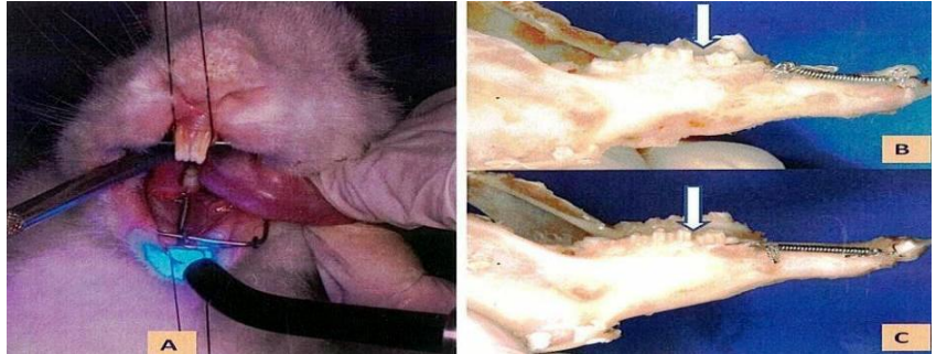
A ). Rabbit with appliance insertion B ).Control Gr – dissected mandible shown increased diastema between I^{st} and 2^{nd} molars (excess mesial molar drift) C ).Exp Gr – dissected mandible shown decreased diastema between I^{st} and 2^{nd} molars (decrease mesial molar drift)