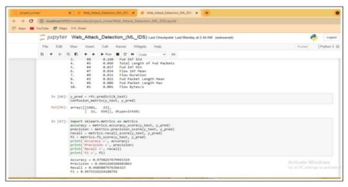
Figure 6.6: Accuracy of System