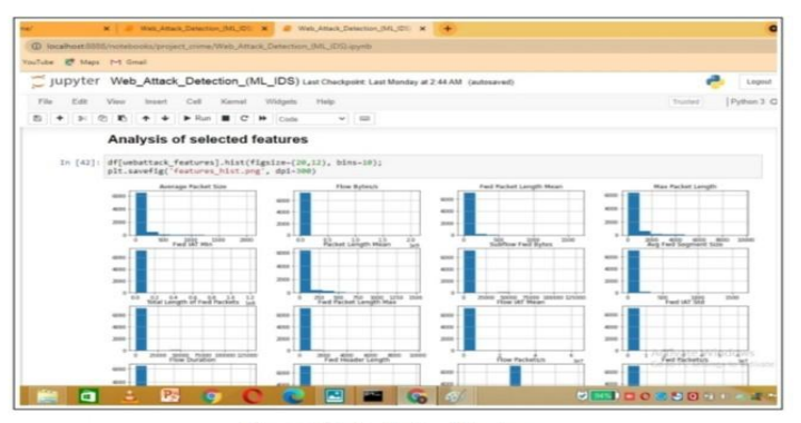
Figure 6.3: Analysis of Features