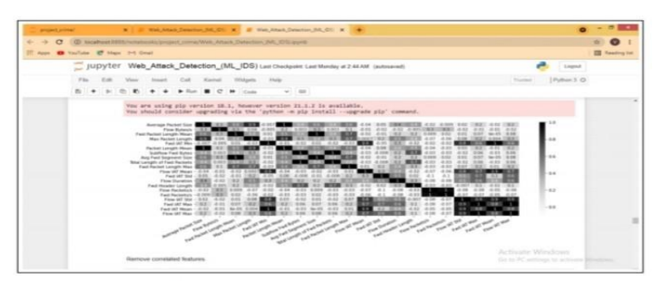
Figure 6.4: Removal of Correlated Feature