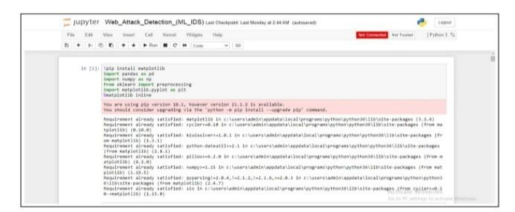
Figure 6.1: Library Import