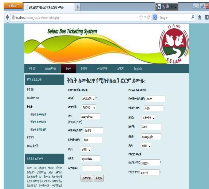
Figure 4.3 Amharic Language Form