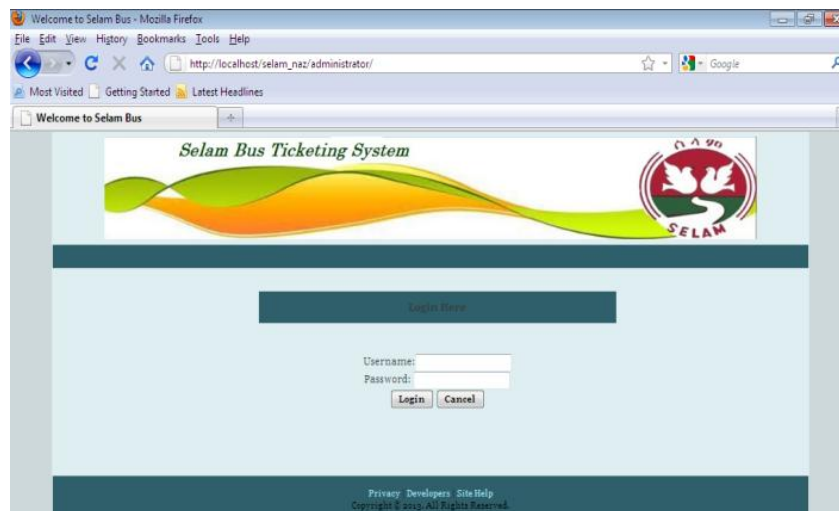
Figure 4.1 Login Page

The development of the web pages can be made possible using the different technology of preference. PHP is chosen as web scripting language for this system. PHP was chosen because it can independently ran on a server, and doesn't matter what type of Operating system you are using, it is likely to run in UNIX, a lot of people use it (widely used, and open source), Integrates with HTML, CSS, javascript, ajax, jquery very well, updated regularly (security etc, solid platform), and Database communication is excellent;