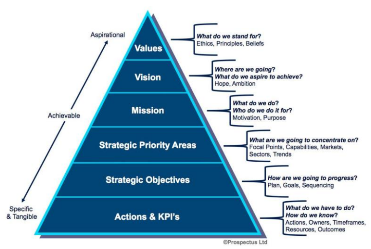
Figure 2- Relationship between ethics, values, vision and mission for organization. (Source Mc Farlane, 2013)

The organizations have mission statement for which it needs a vision and in order to adhere to vision the company formulates values and ethics which are in turn supported by executing and monitoring plans at base level. The Vision and mission statements provide direction, focus, and energy to organization to accomplish the shared goals. The relation between these can be illustrated as in figure 2 (Mc Farlane, 2013)