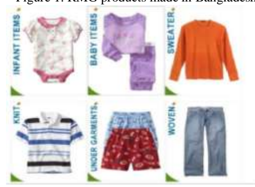
Figure 1: RMG products made in Bangladesh

Reaz Garments Limited<sup>10</sup> has set the milestone by establishing the first RMG Industry in Bangladesh in 1978. Since then, more than 95 percent RMG firms are locally owned with an exception of a few foreign firms located in export processing zones (Gonzales, 2002). The RMG firms are mostly located in the capital city Dhaka, the port city Chittagong and the industrial city Narayangonj . Garments companies in Bangladesh form formal or informal groups. Different kinds of developments were seen in the RMG industry of Bangladesh for the last three decades. During the 1980s and 1990s, manufacturing process was mostly Cut, Make and Trim (CMT)<sup>11</sup>. In the last decade, the traditional CMT production process changed into Composite Corporation (CC)<sup>12</sup> type of production process (cotton to fabric, fabric to design and printing, printing to dyeing and finishing, finishing fabric to RMG sample designing, cutting for the RMG product, Making, Trimming, Ironing and packing for export). Figure 1 shows some sample of Bangladesh RMG product which is continuously exporting.