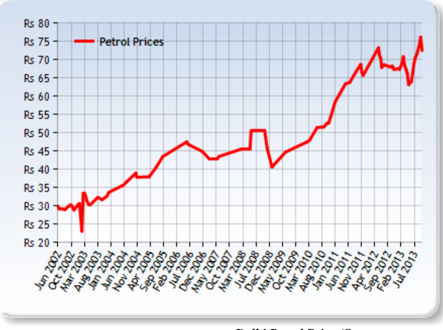
Delhi Petrol Price