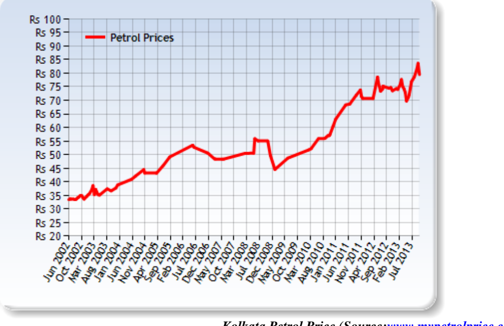
Kolkata Petrol Price

IOSR Journal of Business and Management (IOSR-JBM) e-ISSN: 2278-487X, p-ISSN: 2319-7668 PP 16-23 www.iosrjournals.org