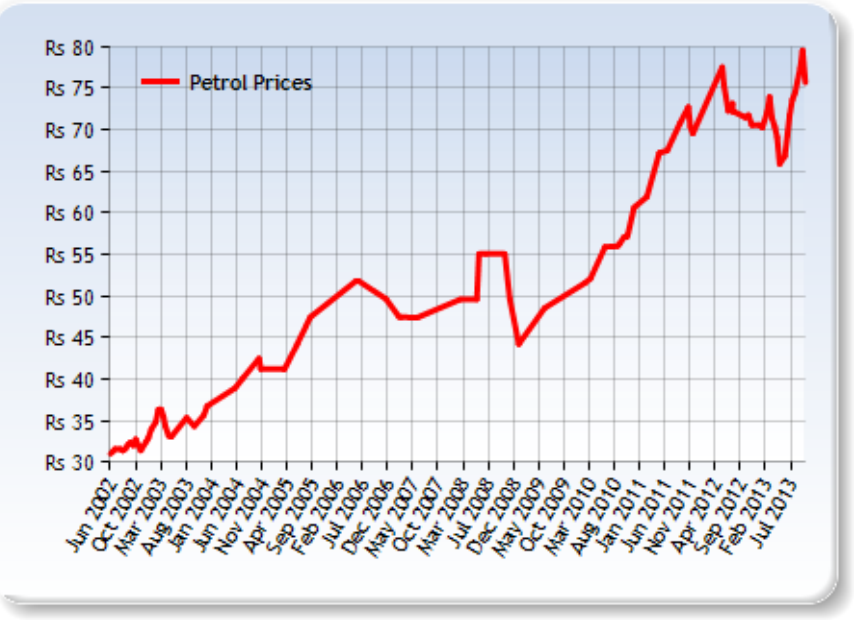
Chennai Petrol Price

IOSR Journal of Business and Management (IOSR-JBM) e-ISSN: 2278-487X, p-ISSN: 2319-7668 PP 16-23 www.iosrjournals.org