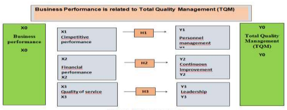
Figure 1. Research construct