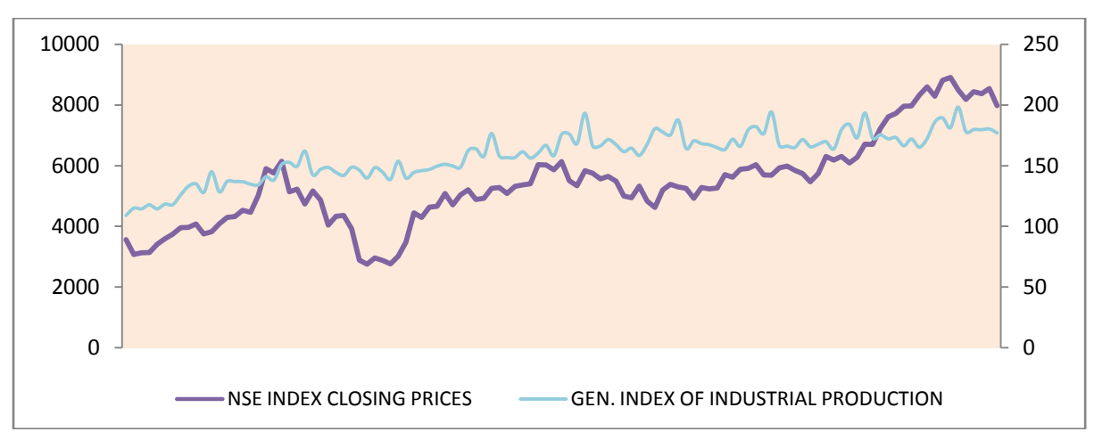
Fig.3, Movement of Nifty 50 and Index General Index of Industrial Production