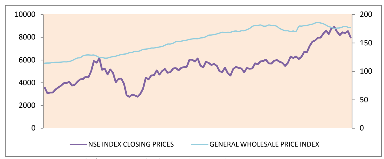
Fig.4, Movement of Nifty 50 Index General Wholesale Price Index