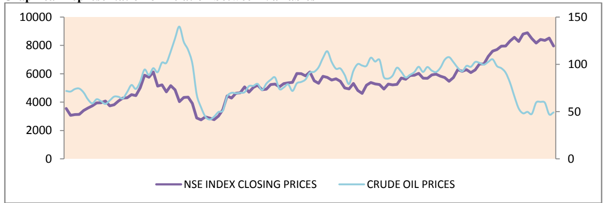
Fig. 1, Movement of Nifty 50 Index and Crude Oil Prices