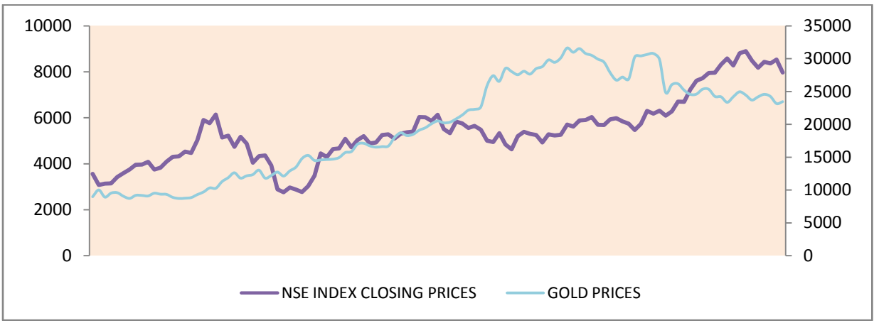
Fig. 2, Movement of Nifty 50 Index and Gold Monthly Closing Prices