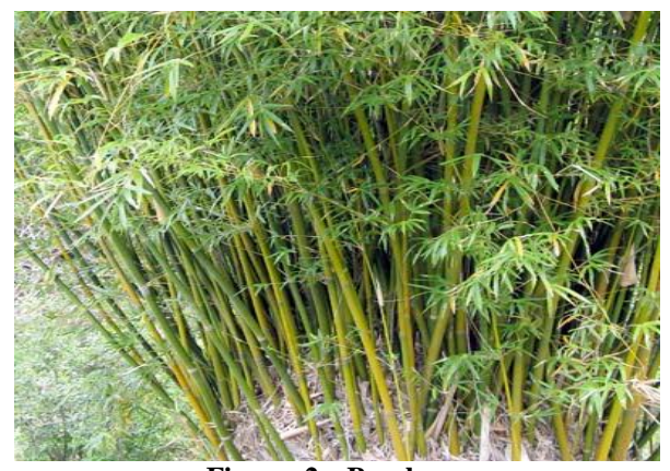
Figure. 2. Bamboos