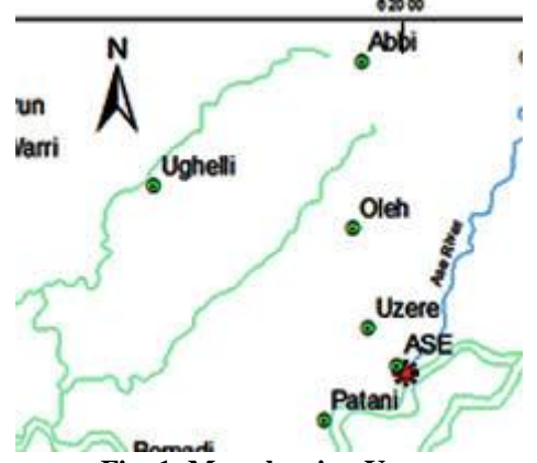
Fig. 1: Map showing Uzere

Uzere formerly known as Uzei as in Figure 1 is an Isoko community located within the GPS coordinates of 6 °5'12"N and 5°200'E. It is a community of nine quarters plays host to two oil fields Uzere East and Uzere West with 43 oil wells (Orise 2013; Evroro 2016; Ahon, 2011; Utoware 2013). They are mainly agrarians, cultivating cassava and groundnut as monocrops. They are also fishermen (Elozino 2013; Okoro 2012; Opia 2015). They also engage in petty businesses (Ekoko 2014; Akiri 2013; Enishera 2012).