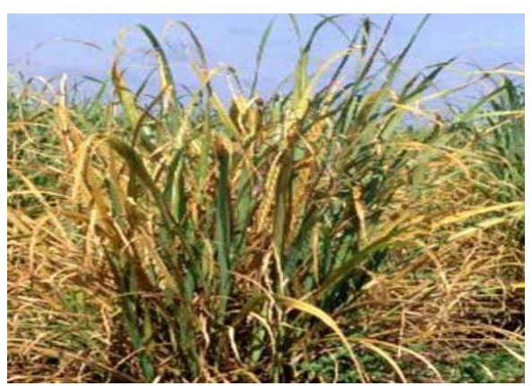
Figure 5. Damage to sugarcane plant in field, by yellow sugarcane aphids, Siphaflava (Forbes).