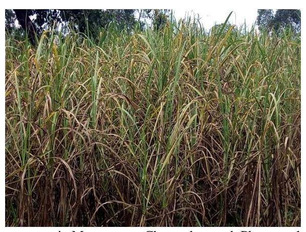
Figure 6. Damage to sugarcane crop in Masungutsa, Chemuche ward