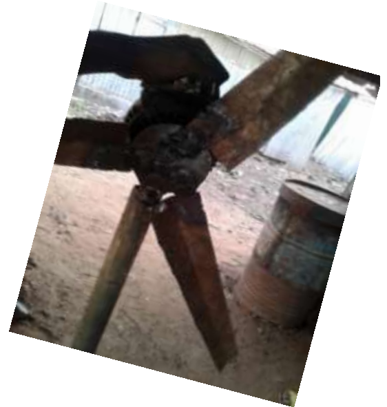
Figure 5: Coupled Alternator, Turbine, Frame and Galvanized Pole