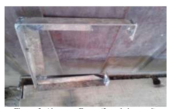
Figure. 3: Alternator Frame (3-angle bar steel)

The frame made up of 3-angle bar steel, which was cut in three different lengths (top breath 6.7 inch, base breath 6.2 inch and height 7.8 inch), was welded together joint to joint of the three joint firmly with gauge 12 electrode. This is shown in Figure 3. There was a need to use the square bar to check if the 3-angle bar is perfectly square. This will make the angles to be at 90° to one another, before securing a permanent welding.