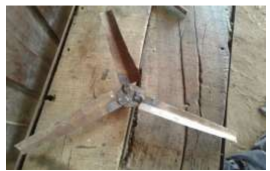
Figure 2: constructed Turbine (3-dimensional blade)