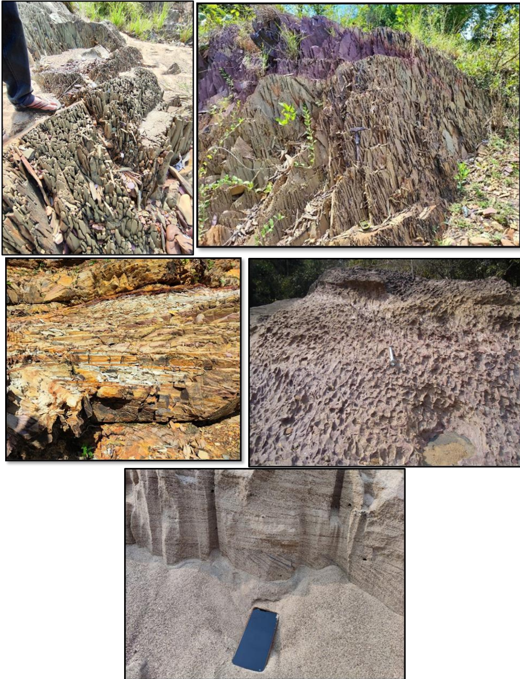
Plate No. 3. Various Geological Features Near Gupteswar cave - 1) & 2) Well Jointed Jagdalpur Shale, 3) Variable Colour of Jagdalpur Shale, 4) crocodile skin weathering, 5) formation of cross bedding structure at Tiriya region.