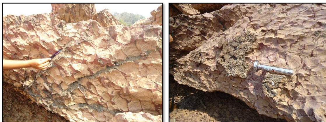
Plate No. 2 -Stromatolitic Dolomite at Gupteswar Area

Gymnosolen, conophyton, Colonella, Tongussida (Baicalia, Anabaria), and Kussiellida are the species of stromatolites that GSI has identified in this area. An Upper Riphean assemblage (1100–700 Ma) is most likely represented by these stromatolites. (Schnitzer, 1977). The Upper Chattisgarh Group of rocks and the Jagdalpur Formation of the Indravati Group of rocks are frequently correlated by the Geological Survey of India. According to the K-Ar technique, glauconitic sandstones near the base of the Chhattisgarh Basin have a radioactive age of 700–750 Ma. When one visits this region, the stromatolytic limestones and dolomites have weathered into fascinating landscapes that resemble crocodilian skin. (Guhey et al., 2011, Jha et al., 2015).