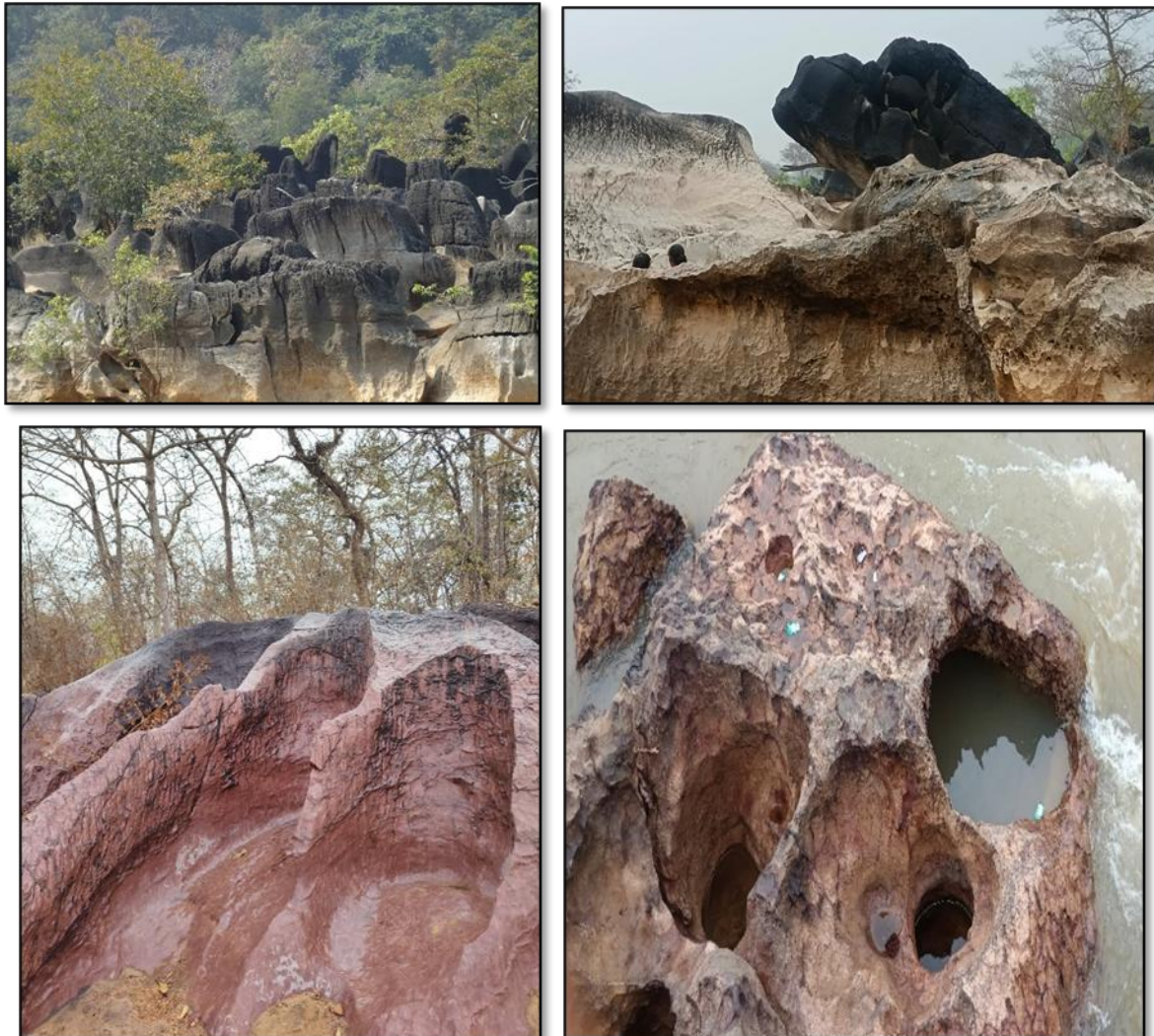
Plate No. 1 – Landforms Near Gupteswar Cave, 1) Exotic Landscape, 2) Tortoise Shaped Weathering, 3) Broken Big Pothole, 4) Pot Holes

Buff and purple-colored Jagdalpur shales are being exposed to the surface in the Bank of Kolab's Tiriya Village, creating stunning, picture-perfect landforms. The Jagdalpur shale in this region is highly strongly jointed, folded, and inclined in a variety of ways. Because of the extremely closely joints, extremely sharp pieces of shale are formed