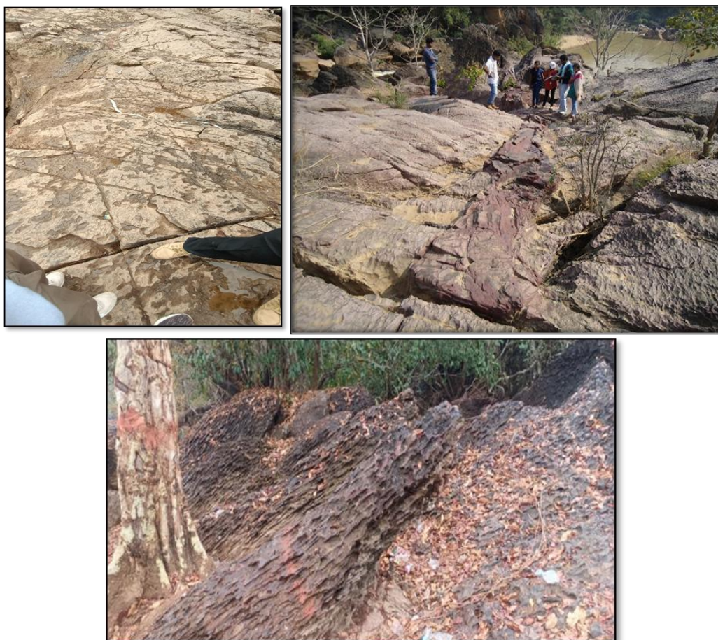
Plate no. 4– Structural features Near Gupteswar cave - 1) Joints, 2. Sedimentary Dyke Near Gupteswar Cave and 3) Inclined Rock Formation