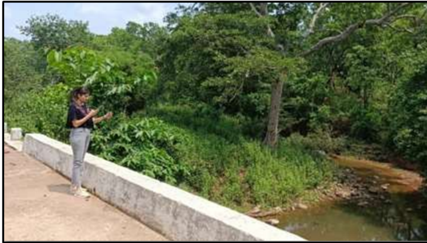
Plate No.1 Tributary of Kanger River

The study area is confined between latitude 18°48'00"N to 19°00'00"N and longitude 81°42'00"E to 82°12'00"E. Kanger watershed is situated in and around the Kanger valley national park in the Bastar district, Chhattisgarh and covers an area of 613.288 km 2 . Based on Google Earth images, the research area's maximum and lowest elevations are 868 and 365 meters above mean sea level, respectively. The Kanger River Watershed is part of the Indravati basin. Sandstone, limestone, shale, and dolomites are the lithologies that support the entire drainage system; the limestone area is karstic. The Kanger River is a well-known river in the Kanger Valley National Park and its environs. It is a Kolab River tributary. This is evident in several naalas, including the Munga Bahar Nala, Jhodi nala, Ekta Nala, Uidir nala, Kola Jhodi, Karanji Jhodi etc. which meet the Kanger River after mostly flowing from NW to SE direction.