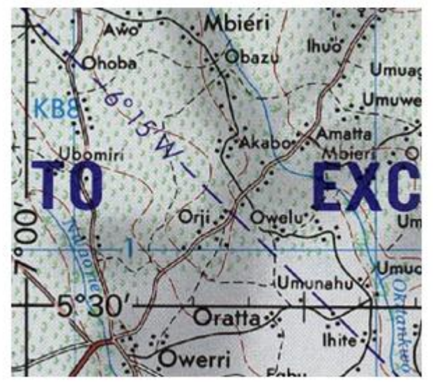
Figure 1: Image showing Akabo Village in Imo State and surrounding communities

Akabo is a village complex in Ikeduru Local Government Area of Imo State, Nigeria, West Africa, Akabo lies on the west of the Okitankwo River, about 10 kilometers northeast of the Imo state capital of Owerri, but a distance of 20 km by road. It is bordered by towns like Mbieri in the north, Iho and Uzoagba in the northeast, Amatta in the east, Orji to the south, and Ubomiri in the west. The major villages of Akabo are Umunnemoche, Amii, Amukachi, Umuiyi, Umuekpere , Umuebem , Obiudo and Amuzu [6]