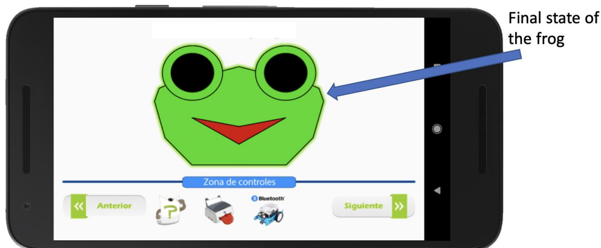
Figure 3: Final state of the frog image, está formada por círculos y triángulos que los niños logran mencionar.

First, the students participated in turns, the teacher asked questions so that the children were giving suggestions about what object represented the perimeter that appeared on the screen and then each student could advance at their own pace in discovering the total images contained in the game.