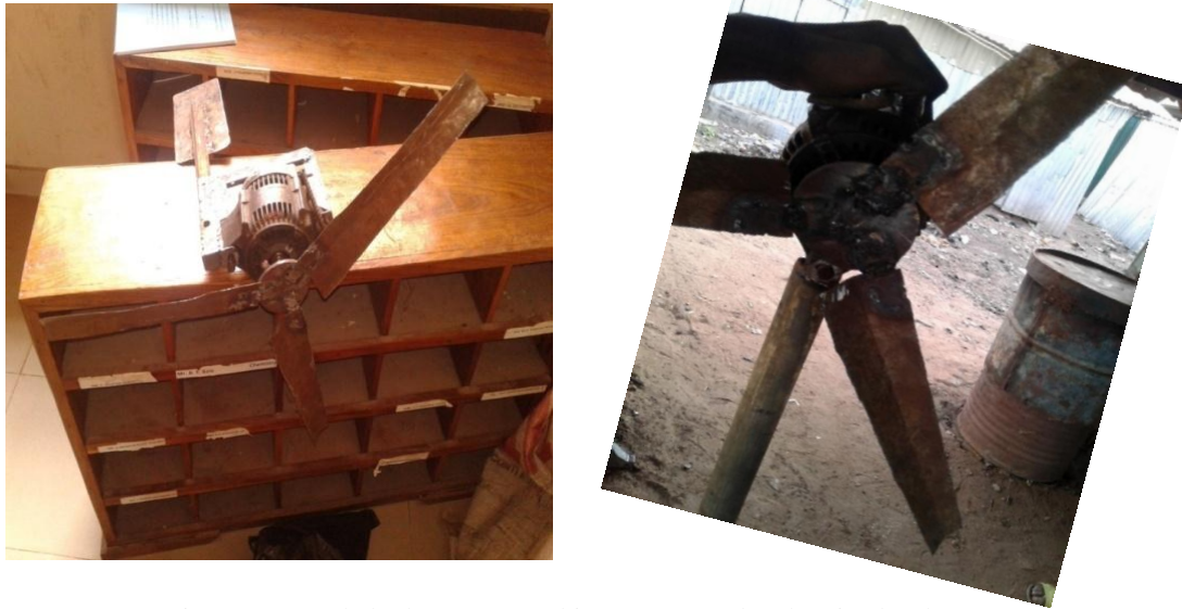
Figure 5: Coupled Alternator, Turbine, Frame and Galvanized Pole

Alternator connected to the blade with the tail was tighten with two 17 spanner size bolt & not of 10 mm tap tread, which hold tight the alternator connected to the blade with the tail together with the galvanized steel pipe stand.