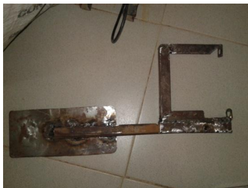
Figure 4: Tail (wind direction) welded with Frame

Steel plate of 0.5 mm thick was cut out with the use of grinding machine, cutting disc tighten to the grinder was use for cutting of the tale for this wind turbine and welded to steel of (3-angle bar) with length of 21 inch. The tail keeps the turbine facing the wind direction, as shown in figure 4. The small wind turbine cannot put motors with orientation of rotor facing the wind direction; almost all small wind turbines have directional arms to guide the rotor into the wind.