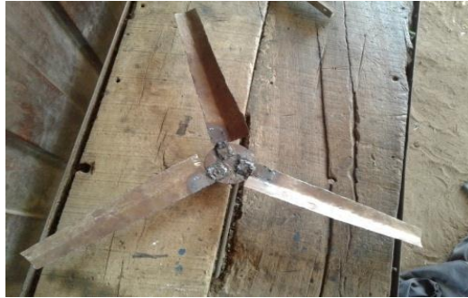
Figure 2: constructed Turbine (3-dimensional blade)