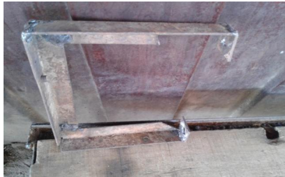
Figure. 3: Alternator Frame (3-angle bar steel)

The frame made up of 3-angle bar steel, which was cut in three different lengths (top breath 6.7 inch, base breath 6.2 inch and height 7.8 inch), was welded together joint to joint of the three joint firmly with gauge 12 electrode. This is shown in Figure 3. There was a need to use the square bar to check if the 3-angle bar is perfectly square. This will make the angles to be at 90° to one another, before securing a permanent welding.