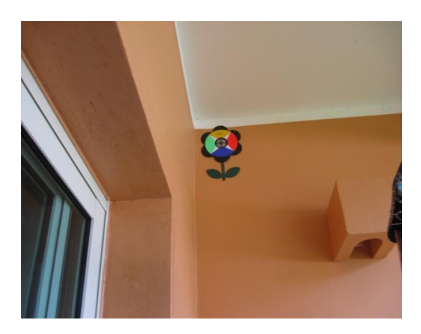
Figure 1. ProVector Flower containing Entobac placed in upper corner of outside balcony of hotel room of the Iberostar Hotel.