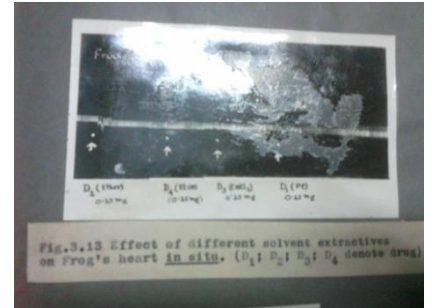
We inject our medicine (in frog's heart in given amount). Effect of the cold alcoholic extractive dissolved in distilled water on the

Cancer is also cured by Orobanche and heart stimulates is also increases by Cascuta reflexa Roxb.