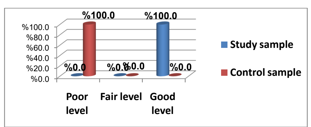
Fig. (2): Patients' knowledge post-test about coronary artery stent: