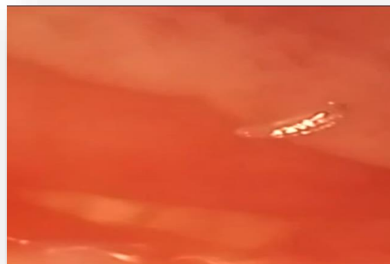
Figure 2-B : magnification x40

We proceeded by mechanical extraction of the larvae associated with washing the eyes and lacrymal passages abundantly with saline after topical anesthesia followed by topical treatment of antibiotics (based on macrolide), corticosteroids and lubricant agents.