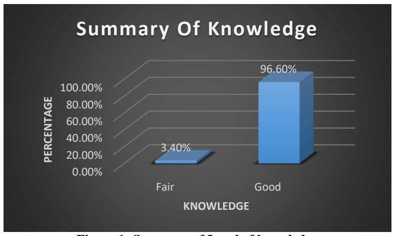
Figure 1: Summary of Level of knowledge

From the Chart, we can conclude that 96.6% of our respondents have a good knowledge of cultural diversity while 3.4% of our respondents have a fair level of knowledge