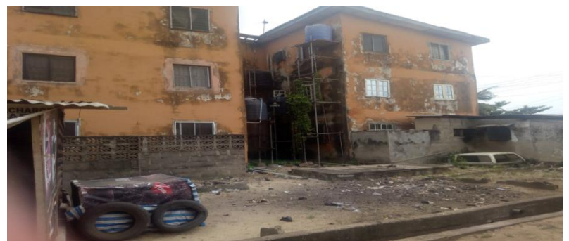
Plate 1: A Typical Building Provided with Water Facilities Using Different Methods