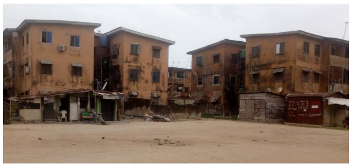
Plate 2: Illegal Installation of Air Conditioners, Television Decoder Signaling System, Water Tank

The study discovered that 42.57% of the buildings inspected have their pipes for liquid waste disposal in good condition, while 57.43% have their own broken and in bad condition. In case of households' water, 37.62% of the sampled buildings have their water pipes in working and in good condition, while 62.38% have their own broken and in bad condition. Because of this situation, 62.38% of the sampled buildings have their structures, including foundations under threat, due water and wastewater leakages, overflowing on the sampled building walls. This has resulted in weakening of building walls and foundation.