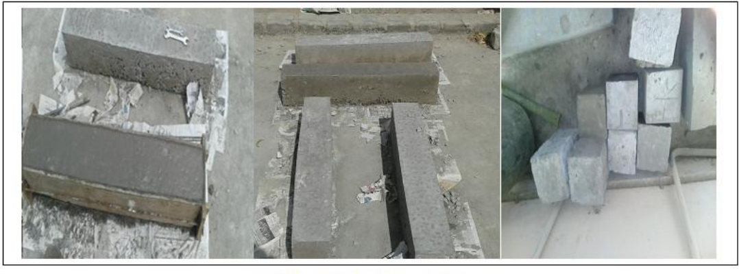
Fig 1: Unmolded specimen