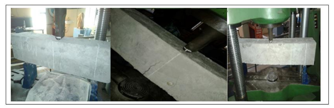
Fig 2: Loading setup for specimen