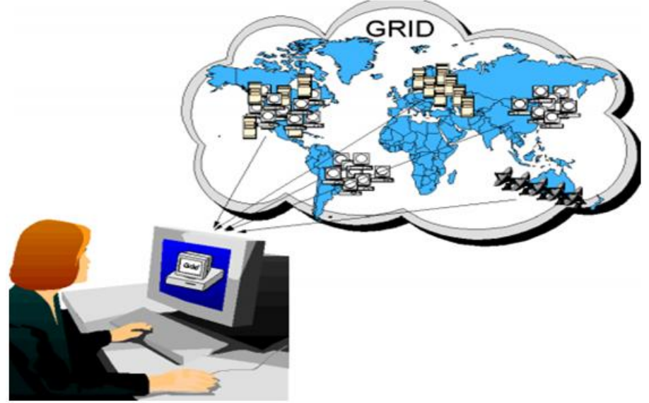
Figure 3: Grid computing management

Parallel CPU capacity: CPU utilization is one of the most common features that we look for in computation. Grid infrastructure has massive CPU parallel operational ability. The work for grid can be thought as many sub-jobs. This sub-job can be executed in parallel individually in different parts of the grid. A perfectly scalable application will, for example, finish in one tenth of the time if it uses ten times the number of processors.