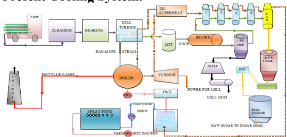
Fig.1.1 Raw Sugar Milling with Present Cooling System

Cane Unloading: Mature canes are gathered by a combination of manual and mechanical methods. Cane is then placed into large piles and picked up, tied, and transported to a sugar factory by means of tractor, truck, or bull car etc.