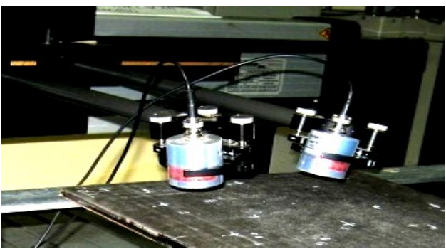
Figure 1b: Transducer arrangement