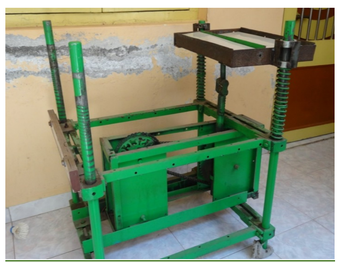
Fig.2. Working Model

Main components used in this model are flat platform, springs, gears, and generator. Flat platform is mounted on the compression spring. This platform is connected with the rack and pinion. Main function of the platform is to transmit the load of the vehicle to the rack and pinion. Hence reciprocation motion is being converted into rotating motion which ultimately transmitted to generator shaft to generate the electricity. Ratchet mechanism between the rack & pinion and gear transmission system is provided to transmit the power in only one direction.