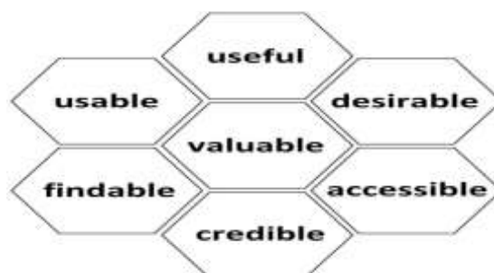
Figure 2. Morville Honey Comp

the issues they should be considered while designing the Web. The core for user experience is ensuring that users find value in what provided to them so in order to meet that information must be valuable, usable, useful, findable and credible and accessible. Each element is described as follows.