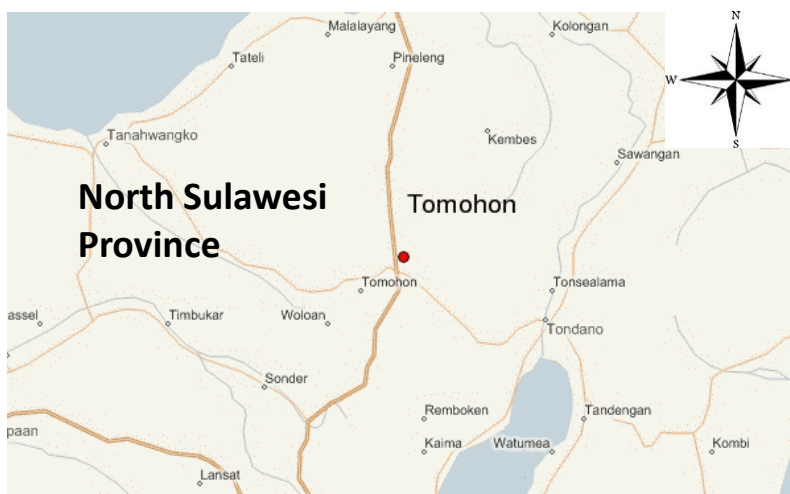
Fig. 1. Geographic position of Tomohon in North Sulawesi Province

The lands in Tomohon have been identified very fertile due to volcanic activity impacts. Farmer cultivated numerous vegetables in highland orchards. Recently, however, farmer cultivate flower as a prospective agriculture commodity. Plantation area found in everywhere with main crops including coconut, clove, vanilla, coffee and Aren palm. Coconut has been cultivated in North Sulawesi province for thousands of years. The biggest production is coconut reaching 484.57 tons in 2011 [9]. The conservation of North Sulawesi's biodiversity is crucial toward sustainable live of society. The challenges for sustainable uses of resources ultimately depend of the human quality improvement [10].