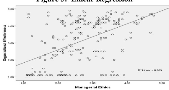
Figure 3: Linear Regression

The univariate analysis shows the empirical referents of Managerial Ethics, starting with Merit with a low mean score of 2.6401 (standard deviation is 1.45521), Integrity has a mean score of 2.4768 (standard deviation is 1.35617), while Justice carries a mean score of 3.0025 (standard deviation is 1.37405) which is the highest. Managerial Ethics as the latent predictor variable carries a mean score of 3.1394 (standard deviation is 1.31472) while Organisational Effectiveness, the criterion variable, carries a mean score of 2.7065 (standard deviation is 0.87959)