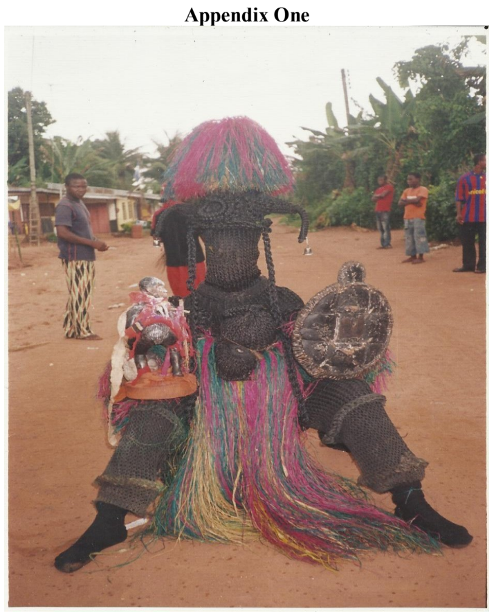
A picture of Okorosha masquerade in Awo-Omamma