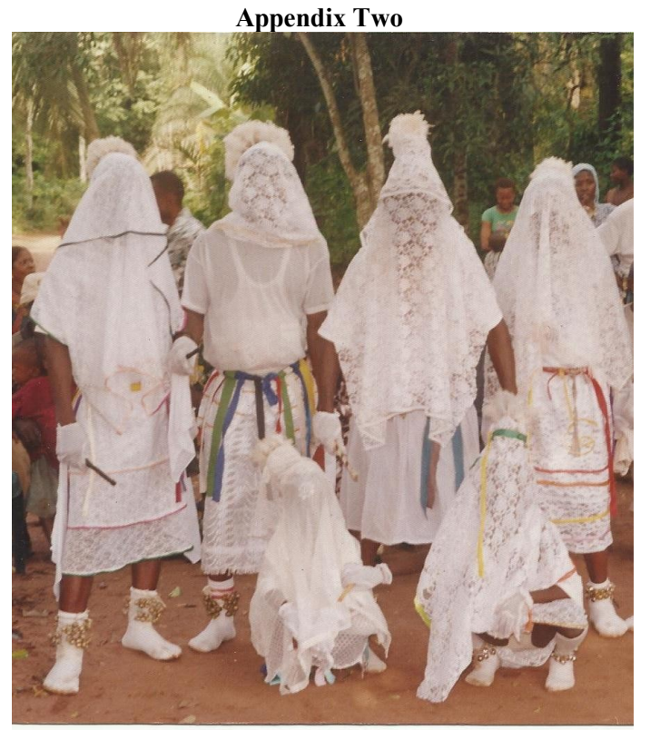
A picture of Owu dancers in Owu abuba costume in Awo-Omamma