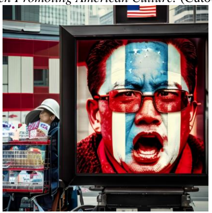
Figure 2 Chinese Citizen Promoting American Culture. (Cutout.pro, 2023).

What America could learn from this particular survey is; what a child is exposed to at a young age determines who they become as an adult. The promotion of American culture should be limited at a young age and slowly introduced are they prosper in age instead of having access to all movies and shows at once from intelligent televisions, tablets, smartphones, smartwatches, and computers. Parents should enforce viewing restrictions on these devices and closely monitor what their children are viewing because modern American culture allows children to view content that the PRC government would never allow a Chinese child to watch.