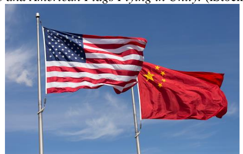
Figure 1 Chinese and American Flags Flying in Unity. (iStock, 2023).