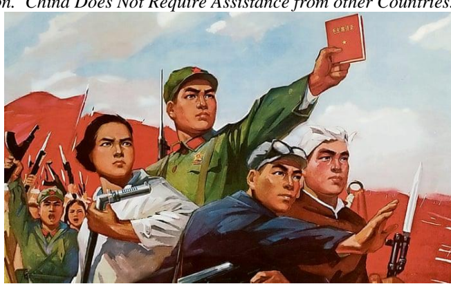
Figure 4 The Cultural Revolution. China Does Not Require Assistance from other Countries. (The Guardian, 2016).

The teacher can educate the students as long as the American teacher follows the guidelines set forth by the Chinese Ministry of Education and the policies put in place by the institution they are employed. A popular course that university students are eager to learn is American culture. As mentioned earlier in this research paper, the young adults of China are interested in the diverse culture of America. The amount of materials available to educate students in American culture is almost unlimited. The teacher can bring American arts, music, geography, social science, history, politics, and folklore into their classroom to promote American culture to their students (Wang, 2019). Integrating attractive PowerPoint slides, video clips, and pictures accompanying the lesson plans for the students can enhance the educational experience for the pupils.