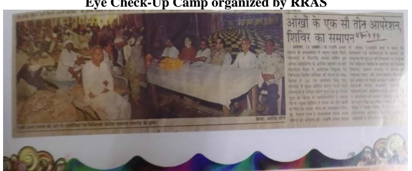
Fig-1.2 Eye Check-Up Camp organized by RRAS

RRAS. Temples play an important role in showing the culture and beliefs of the people. Apart from its concern for society, RRAS has been providing financial assistance to its artists on serious health concerns. It had also organized a regular 'Eye Check-Up Camp', which was free of cost.