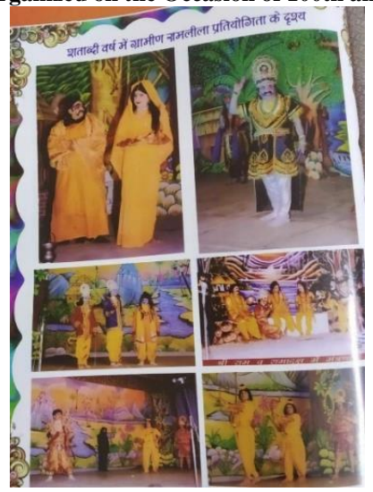
Fig-1.2 Ramleela Contest organized on the Occasion of 100th anniversary of RRAS.

The major dramas performed by RRAS are Ram Leela and BharathariNatak . Due to the tremendous popularity of RRAS, it upholds the obligation for encouraging and promoting the tradition and culture of Hindu Mythology.