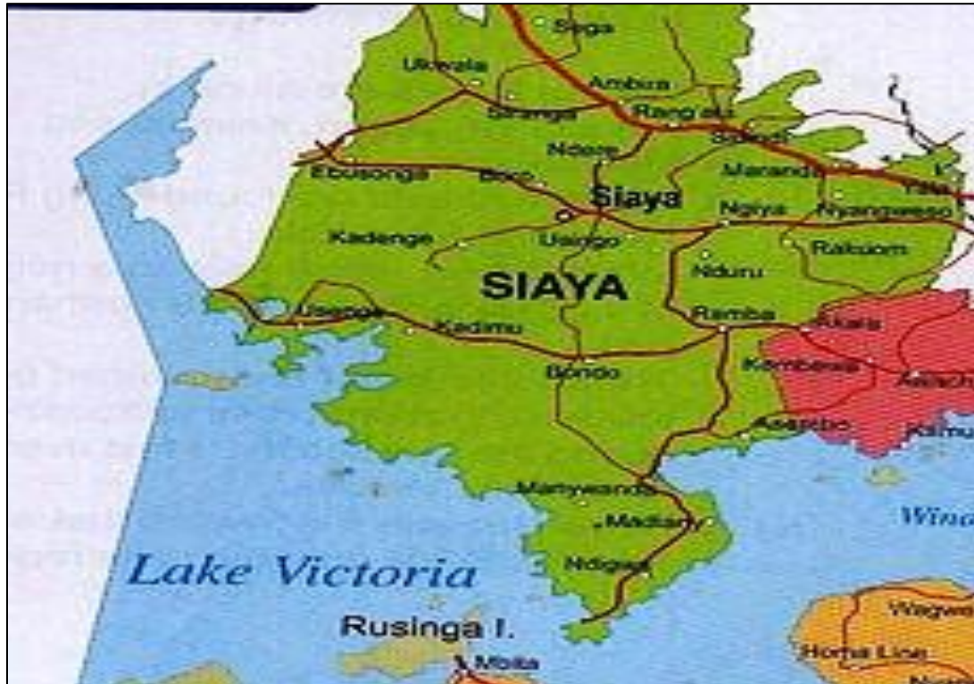
Figure3 Map of Siaya County showing Alego Usonga Constituency