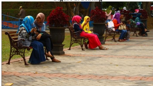
Figure 2. Seating

At the time of entry to the area of the square Merdeka Malang, it appears that the entrance area is very wide and makes it easier for the disabled to get in or out so as to provide easy access for wheelchair users. In addition, the square open space also provides a special place for mothers who breastfeed. In the pedestrian area created quite extensive and allows easy access for disabled people.