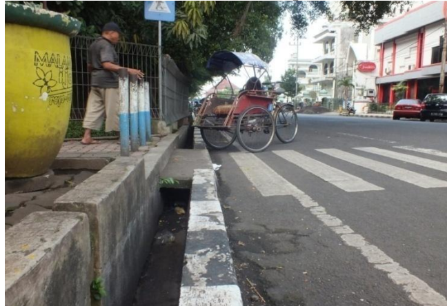
Figure 4. Area entrance is steep and narrow