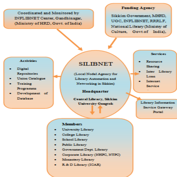
Fig - 2: A Proposed Model for Sikkim Library Network (SILIBNET)

For successful implementation of the SILIBNET Programme, library and information professionals of the state should come forward and take initiatives for creation of this library networking agency and also they should try for enactment of Library Legislation.