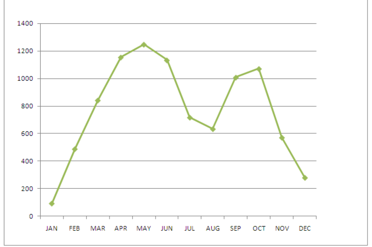
Figure 3: Seasonal Distribution of Thunderstorm over Port Harcourt.

The seasonal variations of thunderstorm, mean, true mean and coefficient of variation (C.V) over the period of study were calculated. The C.V during the study period is 25.96% meaning that TS distribution is reliable. The variation is low. The mean TS is 769.5 peals (approximately 770 peals), the true mean is approximately 26 peals. The mean explain the monthly distribution as if it was just for a year. The true mean explains the monthly condition of TS for the 30 years of study.