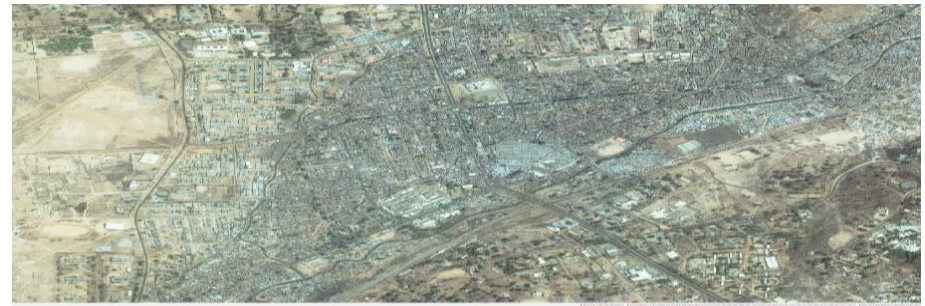
Fig. 3.1: QuickBird Satellite Imagery of the study area

The data collection was done in such a way to meet up with the needs for achieving the aim and objectives of the study.