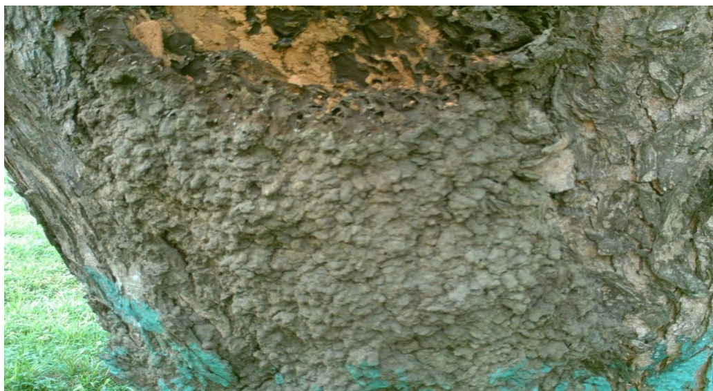
Fig. 4: Plastering of the dried stem bark by Amitermes evuncifer termites