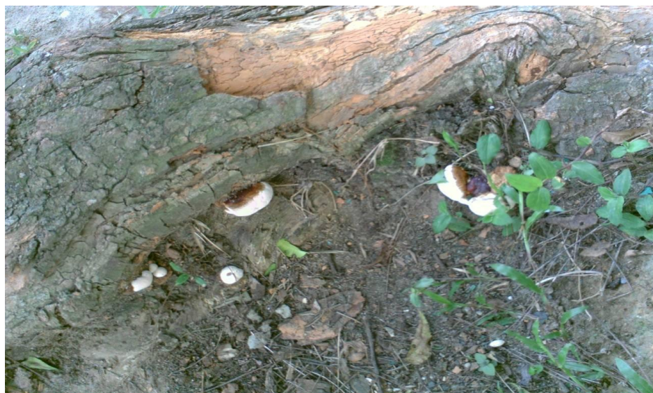
Fig. 3: Fruiting bodies G. lucidum on the exposed lateral branches causing rots and cracks