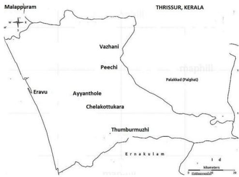
Figure 1: Collection areas in Thrissur District