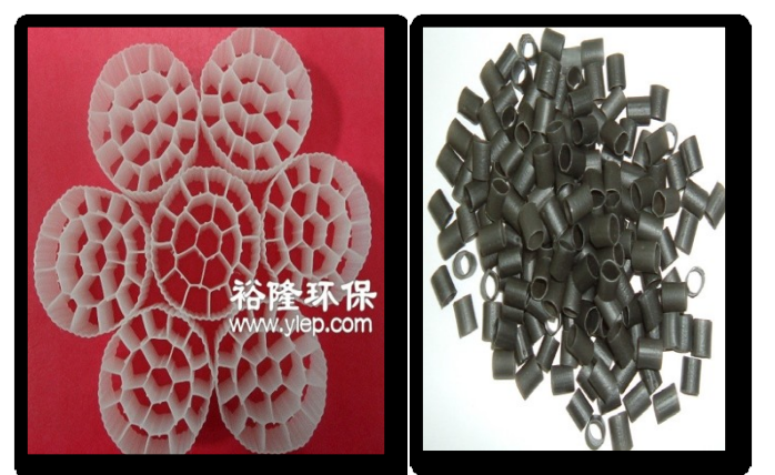
Table 1: Characteristics of the biomedia