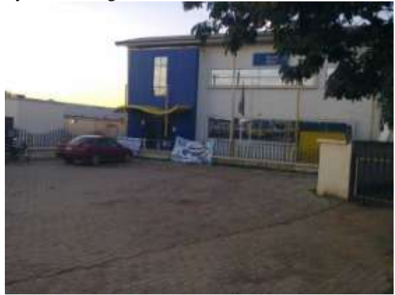
Plate 4.1: Keystone Bank developed within the Kachia road reservation at Sabon Tasha

There are not less five banks namely FCMB, Stanbic IBTC bank, Micro finance bank, Eco bank and Keystone bank located along the Kachia road reservation. These banks owing to their activities, has the potential of generating high traffic thereby constituting serious movement and environmental challenge along that axis.