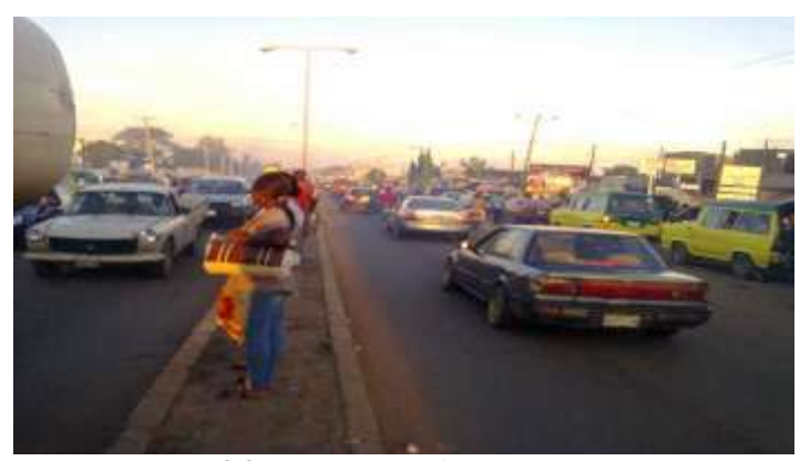
Plate 4.4: On-street parking along the road