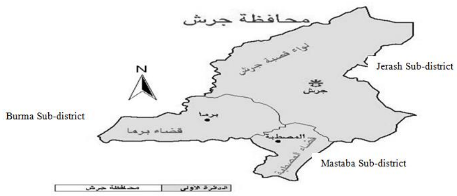
Figure 1 Administrative Sub--districts of Jerash Governorate in Jordan

The study was done on three stages: reviewing official records related to Jerash governorate (from 2000 to 2011), at Ministry of Planning and International Corporation / General Statistical Department, Ministry of Water and Irrigations and Ministry of Environment; selecting households, then taking samples from different resources of drinking water. Jerash governorate that consists of Mastaba, Burma, and Jerash sub-districts as shown in Fig. (1), was divided into clusters, in which each cluster had 2500 persons. Thus the result clusters were 65, after that seven clusters were selected by probably proportionate to size. Then 800 houses were determined according to statistical equation, to be included in the study . To specify number of random houses in each cluster , n was divided by 7. However, actually the number of houses included was 810, distributed as follows: Burma sub- district, 1 cluster: 116 houses ; Mastaba sub-district, 1 cluster: 116 houses; and Jerash sub-district, 5 clusters: 578 houses.