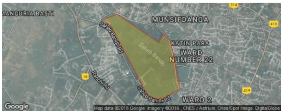
Fig:- Google map of Saheb bandh

Sahib bandh is located in the district of Purulia, West Bengal, India (23° 20'1"N 86° 21'3"E). It is a large 88 acre man made pond and is popularly called an artificial lake.