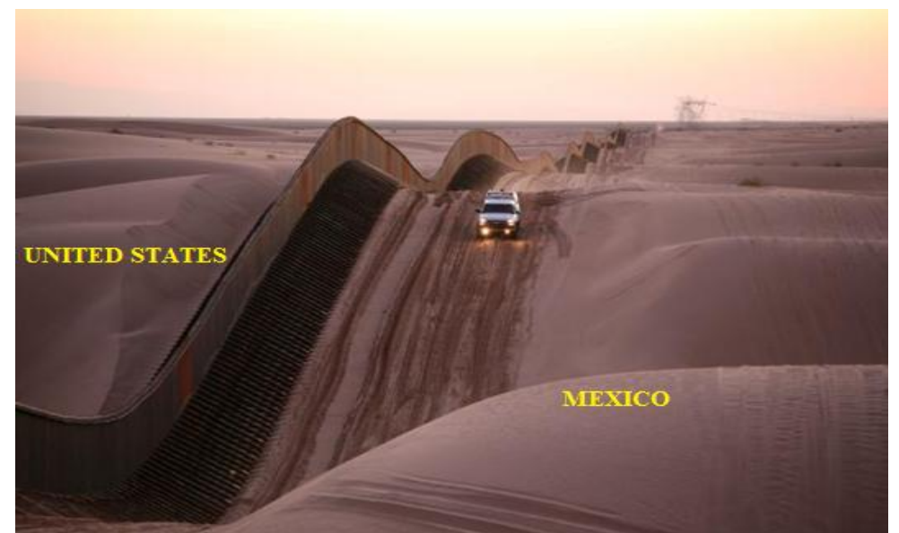
Fig 1: Stretches of steel fence erected across empty desert of USA-Mexico international boundary.