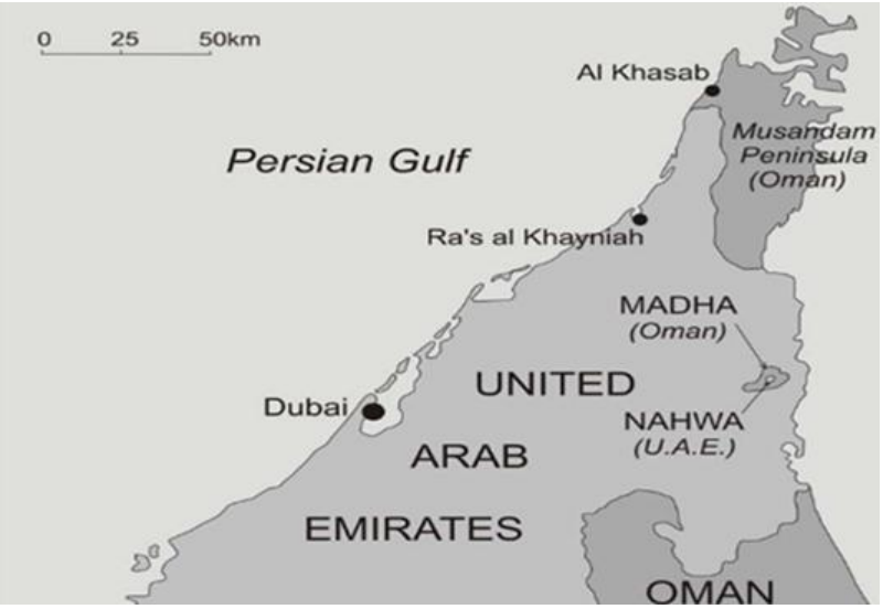
Fig 6: Enclaves and counter enclaves: Complicated international boundary