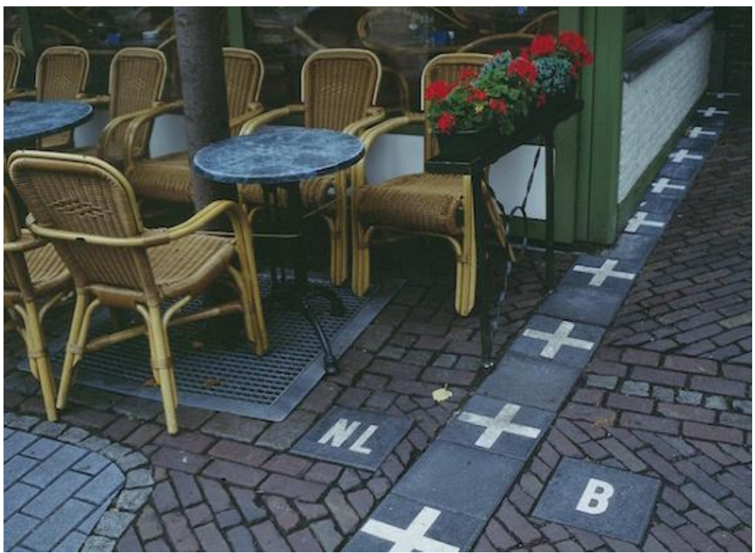
Fig 5: A peculiar international boundary line (Netherlands-Belgium boundary)