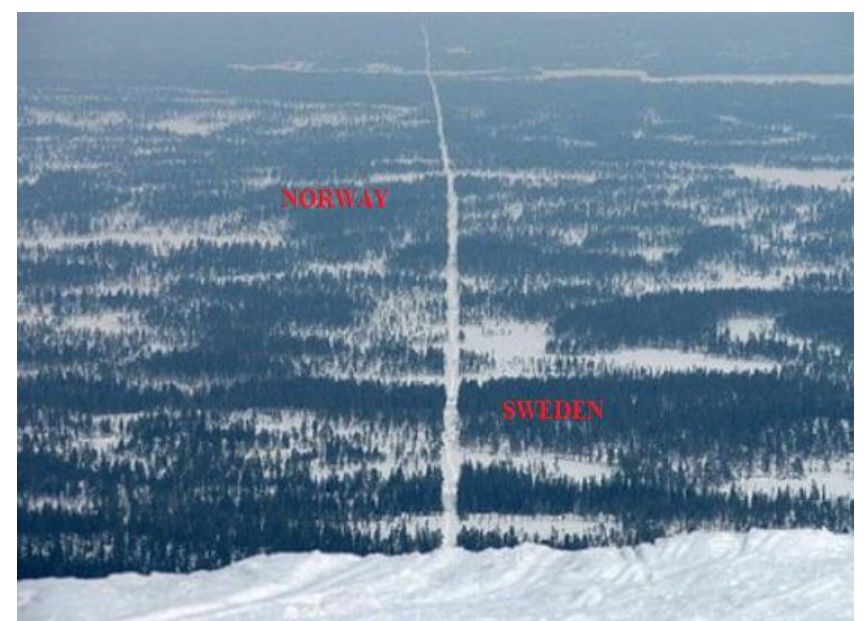
Fig 3: Snowmobiling in border vista of Norway-Sweden

International boundary lines that appear to be simple and straight perhaps include that of Norway-Sweden where crossing the border between Sweden and Norway does not require a passport due to the Nordic Passport Union and secondly there is no physical border obstruction along the 1,630km. long boundary which mostly follows the drainage divide in the Scandinavian Mountains. The border may be just a border vista running through its forests, but its function as an international boundary remains relevant. Regulations are strictly observed along the border vista, an example of which is one that concern snowmobiling (Fig 3); snowmobiling for fun is prohibited and illegal in Norway but not in Sweden. The strict laws in Norway allow snowmobiling relating to work only. The border vista that separates these two countries provides no discretion in this context.