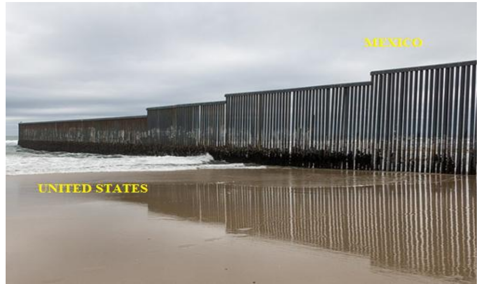
Fig 2: Stretches of steel fence erected near water edge to demarcate the US-Mexico international boundary.