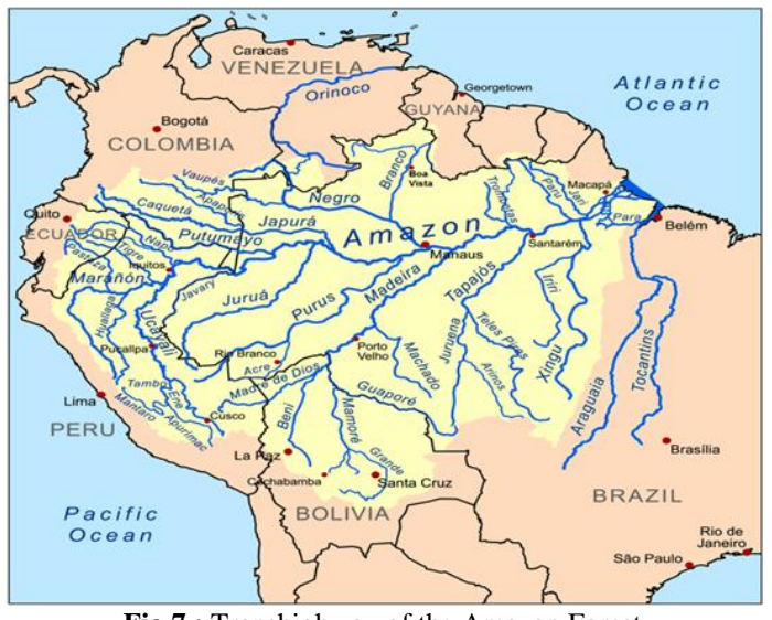
Fig 7 : Transhighway of the Amazon Forest