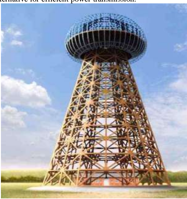
Figure 1. The 187-foot wardenclyffe tower

Any problem can be solved by state-of-the-art technology. The above discussed problem can be solved by choose an alternative option for power transmission which could provide much higher efficiency, low transmission cost and avoid power theft. Microwave Power Transmission is one of the promising technologies and may be the righteous alternative for efficient power transmission.