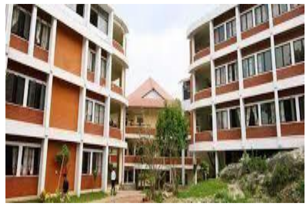
Fig.1: LMCST Campus

The audit was conducted at Lourdes Matha College of Science and Technology (LMCST), Thiruvananthapuram, an engineering college affiliated to APJ Abdul Kalam Technological University. It has a spacious campus of 25 acres at Kuttichal, a rustic village in the outskirts of Thiruvananthapuram city, hardly 24 km away from it. The audit was conducted in the whole campus which covers Main Block, Electrical Block, CS Block, Civil Block, Mechanical Block, Workshop Block, Ladies and Men's Hostel.