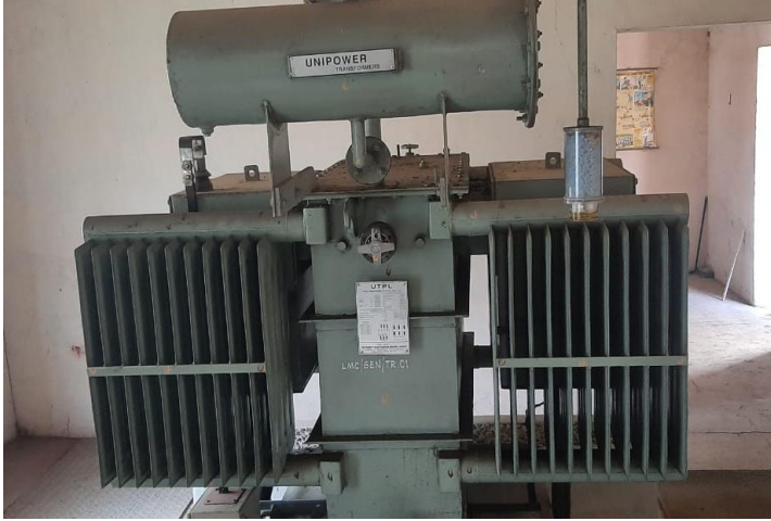
Fig.3: 400 KVA, 11kV/433V distribution transformer

HT–II (B) Tariff is applicable here. This tariff is based on three different zones. They are Normal period, Peak period and Off peak period. KSEB charges 6.2 Rupees for Normal period (6.00 AM - 6.00 PM), 9.3 Rs for Peak period (6.00 PM-10.00 PM), 4.65 Rs for off peak period (10.00 PM-6.00 AM) and 200 Rs for increase in maximum demand. If power factor is beyond 0.9, Penalty is imposed on electricity bill by KSEB and if it exceeds 0.9 bonus will be given. Trivector meter is used for energy calculation.