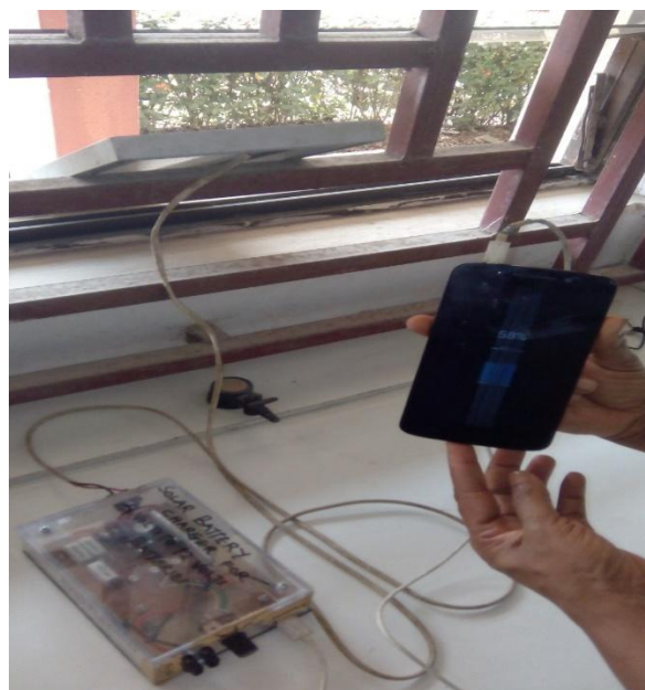
Figure 2. Solar battery charger charging a Techno mobile phone

The Panel was placed in sunlight and the appropriate output terminals were connected to a solar lantern and a Techno mobile phone as shown in Fig. 2 and Fig. 3, to test the charging reliability and capabilities. The charging of an empty mobile phone and a drained rechargeable lantern to their full capacity under direct charging between the hours of 10.00 am to 4.00 pm, has proven beyond any doubt that the universal solar charger will definitely meet the needs of the common man in Africa, especially Nigeria (remote areas or villages).