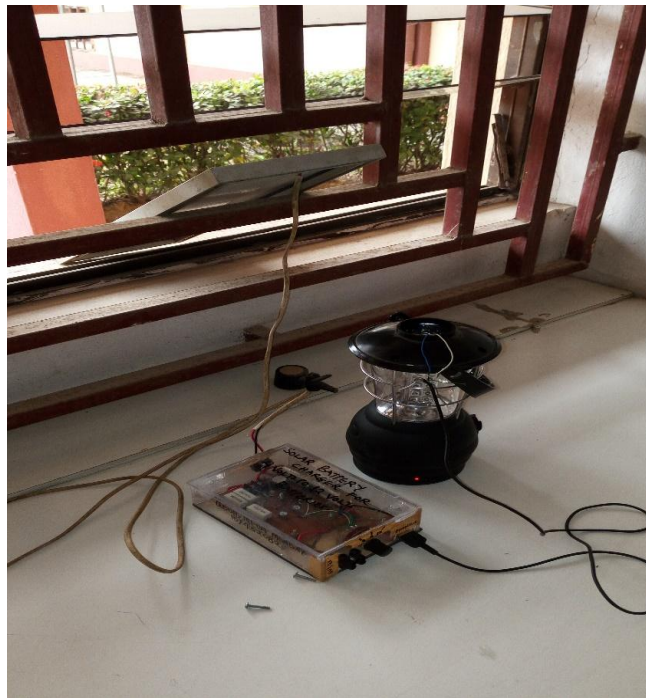
Figure 3 Solar battery charger charging a solar lantern